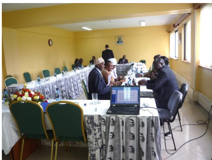
Public Policy Analysis

The composition of the fellowship programme's courses has changed significantly in 2010, and the process of transferral of the short interdisciplinary courses is on-going with cooperation agreements with six training institutions in South (STI). Many actors play a role in the process, and not all actors have the same perception of urgency as DFC. It is primarily the three actors (DFC, STIs, and Embassies), who are influencing the speed of the transferral of courses, taking into account need assessment, timing of the courses, availability of teachers and teaching facilities, and communication.